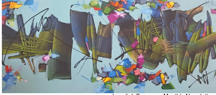
Legalink European Monthly Newsletters