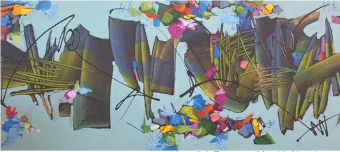
Legalink European Monthly Newsletters